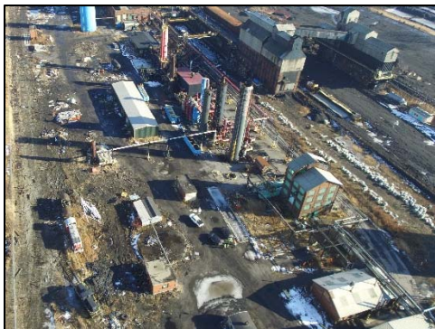
Northwest portion of facility before Interim Site Management (top, DEC photo) and same area after substantial completion of site management activities (bottom, RITC photo).

In 2018, environmental violations involving air and water pollution, as well as faulty equipment, resulted in swift enforcement actions against TCC by DEC and the U.S. Department of Justice. These actions directly contributed to TCC's closure in October 2018.