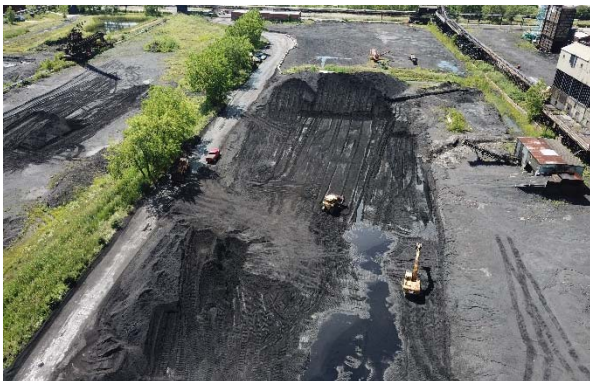
Coal and coke inventories being removed for reuse elsewhere.

A licensed surveyor created a topographical map for the property to provide a baseline for site-monitoring activities. Baseline air quality and weather data are also being collected and will supplement RITC's Community Air Monitoring Plan.