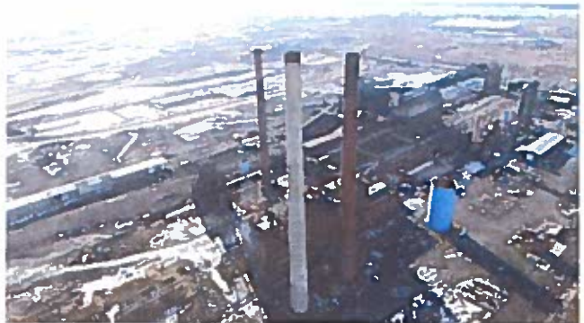
Coke ovens, by-products, storage tanks, stacks and other above-grade infrastructure remain on site today, but will be demolished during the Brownfield Cleanup Program.

The Riverview Innovation & Technology Campus (RITC) site encompasses about 86 acres of the 102-acre former Tonawanda Coke Corporation (TCC) facility at 3875 River Road, Town of Tonawanda. The site was used for more than a century as a coke manufacturing and byproducts recovery facility – most recently by TCC between the late 1970s and 2018.