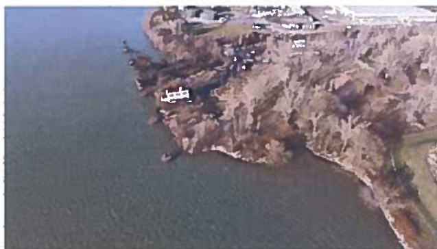
OU3, also referred to as Site 108, (shown above) is an operable unit nearest the Niagara River where an abandoned tank farm was located.

Outside of the boundaries of the main facility comprising the BCP footprint are three operable units that will be fully remediated by Honeywell International. In February 2020, DEC executed a consent order with Honeywell International, the corporate successor to a prior facility owner, to investigate and remediate each operable unit in a manner that is fully protective of public health and the environment.