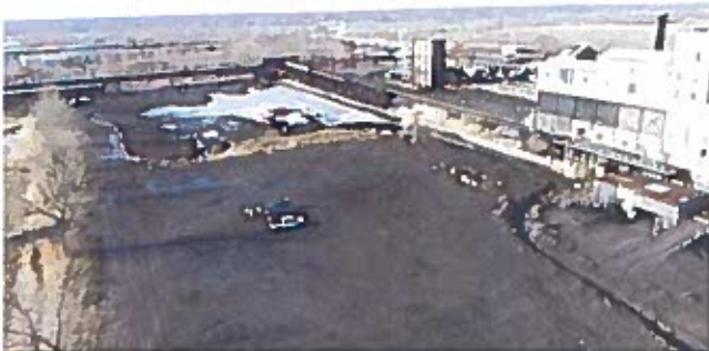
Coal and coke inventories left on-site are being removed for reuse elsewhere.