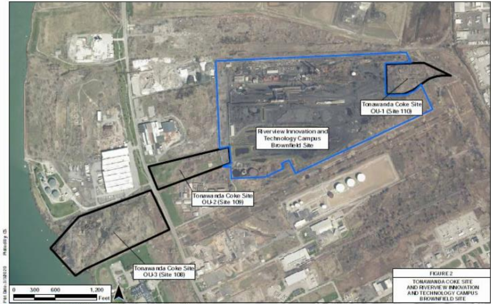
FIGURE 2 TONAWANDA COKE SITE AND RIVERVIEW INNOVATION AND TECHNOLOGY CAMPUS BROWNFIELD SITE

File Path: Q:\GIS\Hous_Spac\env\Tonawanda_Coke\Tonawanda Site Overview Fig 2 CS V2.mxd Date: 3/3/2020 Made by: CS