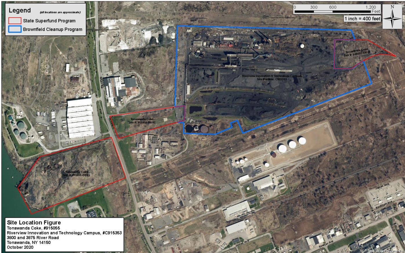
Author: Ben McPherson Revised: 10/9/2020 N:\private\R9\Tonawanda Coke\Figure 1 - Site Location Map.mxd