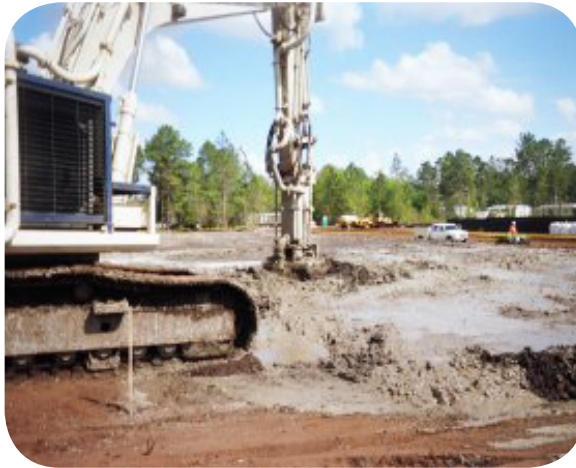
Large augers inject and mix binding agent with contaminated soil.

The additives used in solidification and stabilization often are materials used in construction and other activities. When properly handled, these materials do not pose a threat to workers or the community. Water or foam can be sprayed on the ground to make sure that dust and contaminants are not released to the air during mixing. If necessary, the waste can be mixed inside tanks, or the mixing area can be covered to minimize dust and vapors. The final solidified or stabilized product is tested to ensure that contaminants do not leach. The strength and durability of the solidified materials are also tested.