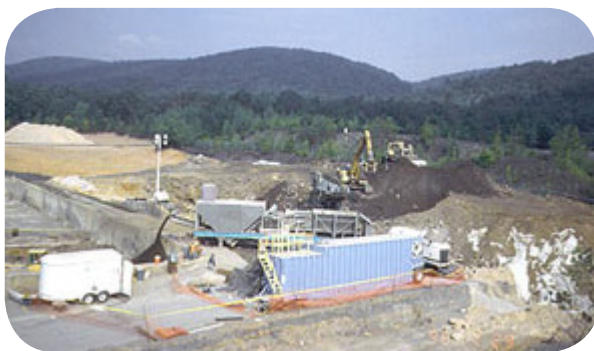
Contaminated soil mixed with cement in a pug mill is spread on the ground as pavement.

Solidification and stabilization provide a relatively quick and lower-cost way to prevent exposure to contaminants, particularly metals and radioactive contaminants. Solidification and stabilization have been selected or are being used in cleanups at over 250 Superfund sites across the country.